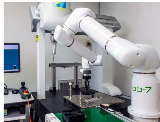
Quality Control & Inspection