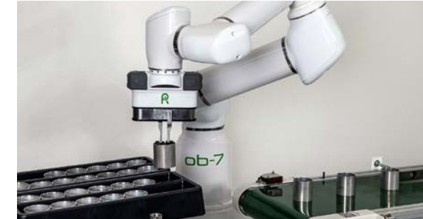
Pick & Place

OB7 productivity goes straight to your cash flow. With OB7 financing, the cash flow payback time is typically 10 days. Hourly lease cost is $3.50 per hour (single shift, 5 days/week) or less ($1.25/hr for 2 shifts-7 days/week). OB7 is generating cash in only 10 days.