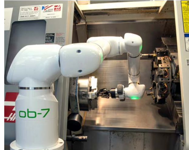
Machine Shop Loading & Unloading