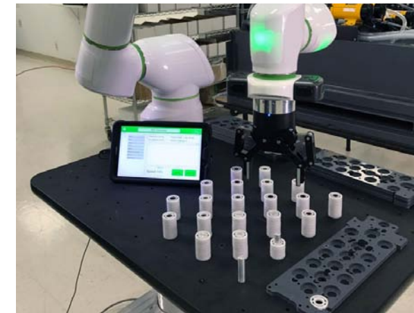
Assembly & Gluing